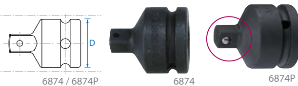
6874 / 6874P