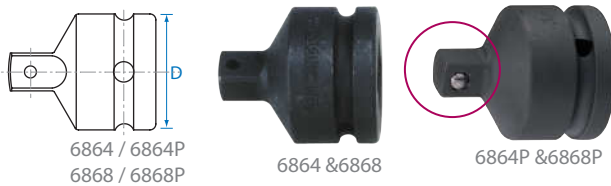
6864 / 6864P 6868 / 6868P