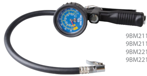
9BM2110 9BM2111 9BM2210 9BM2211