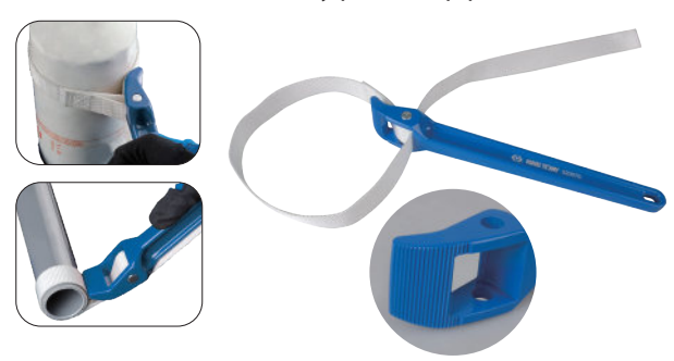
• Serrated makes grip tight