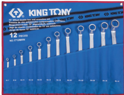
► MRN / SRN : Teton pouch bag