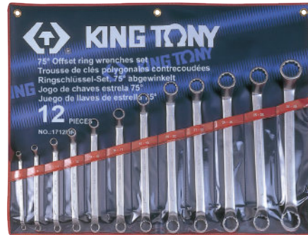
► MR / SR : Nylon pouch bag