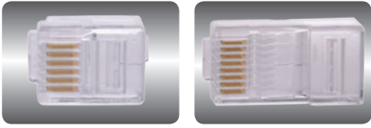
• 6P • 8P