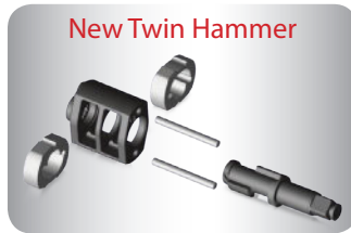
New Twin Hammer