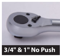
3/4" & 1" No Push