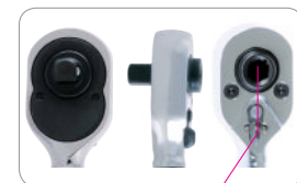
276A-04G (top, side, back)