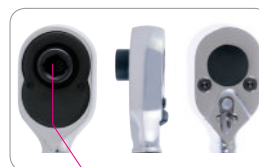
2765-04G (top, side, back)