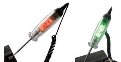
Positive (+) polarity