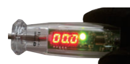
Negative (-) polarity