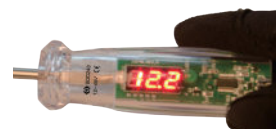
Positive (+) polarity